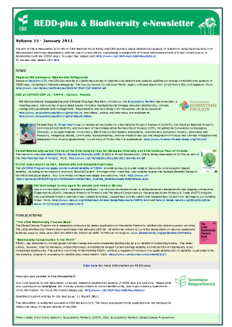
REDD-plus and Biodiversity e-Newsletter January 2011, Volume 13