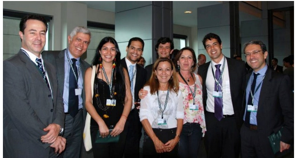
Delegates at the reception hosted by the CBD Secretariat.

report was held from 30 June to 2 July, 2010 in Budapest, Hungary. A few countries from Europe and West Asia attended the workshop and all of them found it useful for their work on the fourth national report.