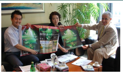
Representatives of MISIA, Honorary Ambassador for COP 10