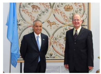
Joseph Deiss, President-elect, 65th session of the United Nations General Assembly