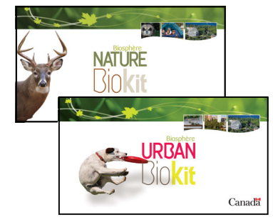
To highlight the International Year of Biodiversity in 2010, the Montreal Biosphère is producing a series of BioKits to incite families to explore urban and natural areas by using their five senses. A series of interactive, outdoor activities offered in both the Urban BioKit and Nature BioKit initiate participants to biodiversity and offer ways of taking action to preserve it.

high incidences of amphibian deformity in response to environmental degradation through his creation of aesthetically rich images and intriguing installations. For more information on the exhibit, please visit: http:// www.artscatalyst.org/