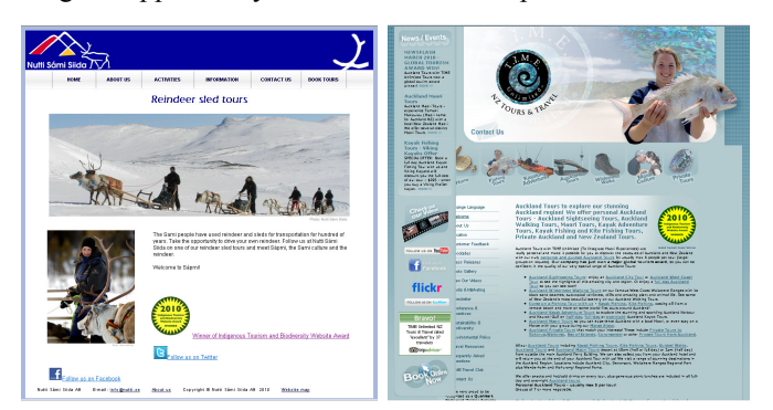
Screenshots of the winning websites.

The Indigenous Tourism and Biodiversity website award was created in 2008 to showcase best practices in web-based technologies helping indigenous people manage tourism in a biodiversity-friendly way, and complements the CBD workshop series on indigenous tourism, biodiversity and web-based technologies supported by the Government of Spain.