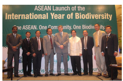
Representatives from the Government, regional and international organizations at the ASEAN launch of the International Year of Biodiversity