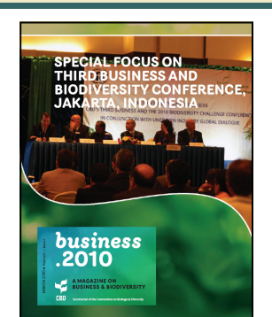
Business.2010 - Vol. 5, Issue 1 Special Focus on the Third Business and Biodiversity Conference held in Jakarta, Indonesia http://www.cbd.int/business/ newsletter.shtml