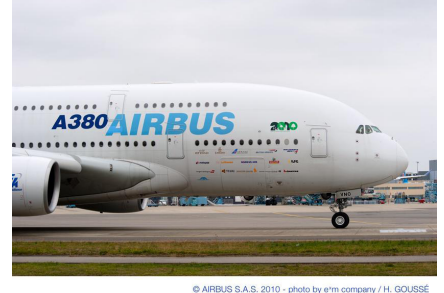
Leading aircraft manufacturer Airbus is showing support for the United Nations International Year of Biodiversity by featuring the official logo on its largest passenger aircraft - the A380. The A380 will carry the logo throughout 2010 during its scheduled activities.