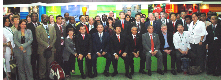
leads of delegations posed for a photograph after the International Year of Biodiversity celebration.

In the margins of the ABS-9 meeting, special events were organ- cessible at: http://www.cbd.int/cop-bureau once finalized. ized to mark the International Year of Biodiversity and to celebrate the World Water Day.