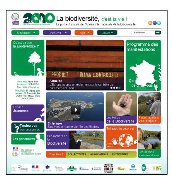
Ministère de l'écologie, de l'énergie, du dévéloppement durable et de la mer of France launched its IYB site: www.biodiversite2010.fr