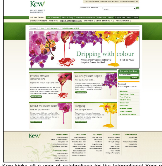
Kew kicks off a year of celebrations for the International Year of Biodiversity with a riot of colour at its Tropical Extravaganza 2010. For more information, please visit: http://www.kew.org