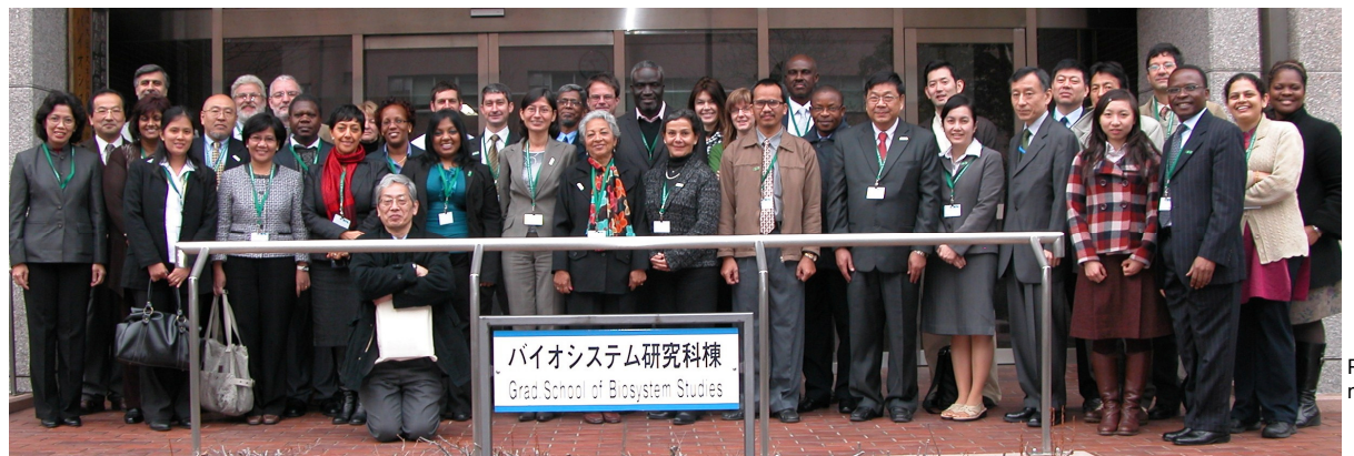
Participants at the Tsukuba meeting.

Staff from CBD Secretariat participated in the CPF Strategy meeting on 15-17 February, as well as the FAO CPF Meeting on "Defining Forest Degradation" on 17 February. Issues discussed include: linkages between sustainable forest management and CBD provisions, as well as an update on IYB and COP 10, stock-taking of the results of the UNFCCC COP-15. The CBD staff then travelled to Bonn to meet with German officials from the Federal Ministry of the Environment (BMU) to discuss preparations for joint activities in 2010, including a possible workshop on the implementation of the forest programme of work in support of climate change mitigation and adaptation. A meeting was also held with officials from the Federal Ministry for Economic Cooperation and Development (BMZ) to discuss UNFF/CBD joint activities.