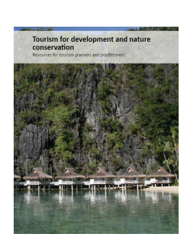
Tourism for development and nature Conservation To view brochure. go to: http://www.cbd.int/doc/ publications/development/ brochure-tourism-en.pdf (also available in French)