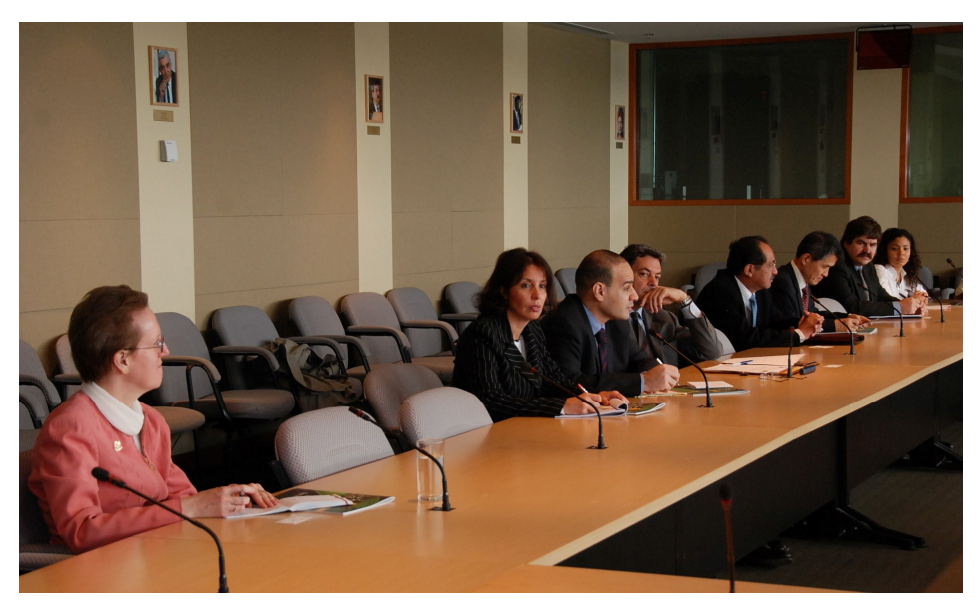
Briefing of Montreal diplomatic corps on COP-MOP 4 and COP 9 meetings, which took place on 5 May 2008 at the CBD Secretariat.